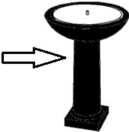
FT-246B (116 lbs) 20.5"W x 30.25"H

Assemble your fountain on a level surface capable of holding a minimum of 70 pounds with an approximate 8 square inch footprint.